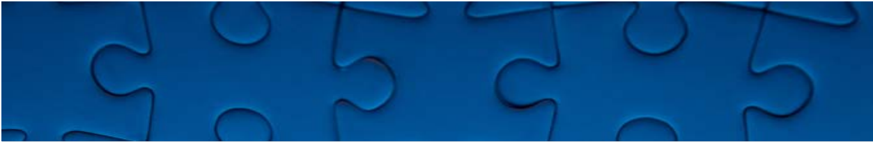
FIGURE 1. OVERALL ARCHITECTURE OF THE CORE COMPETENCIES FRAMEWORK